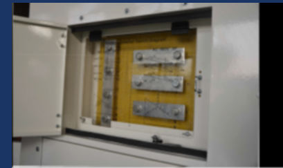
LINK BOARD VOLTAGE SELECTION