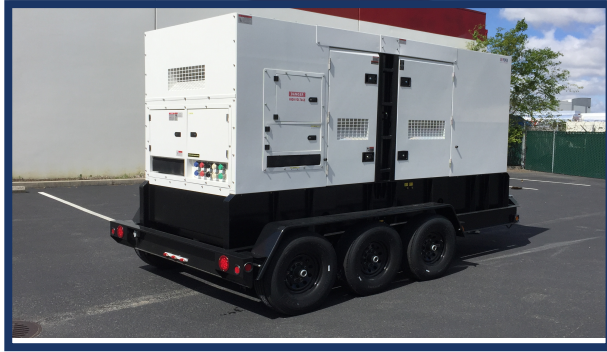
LARGE CAPACITY FUEL CELL

UQ-625: Standby Rating: 625kVA / 500kW Prime Rating: 569kVA / 469kW