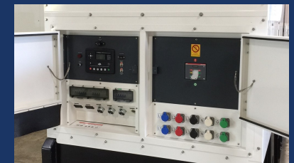
CUSTOMER CONNECTION CAM-LOK STANDARD