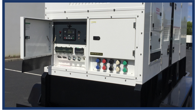
CUSTOMER CONNECTION PANEL