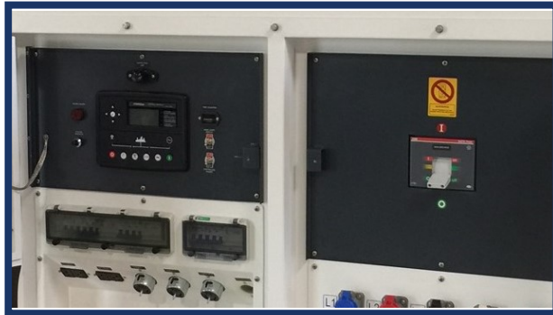
REAR CONTROL PANEL WITH MLCB