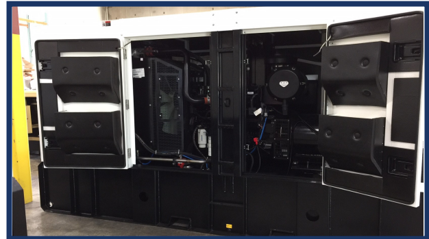
EASY ACCESS FOR MAINTENANCE